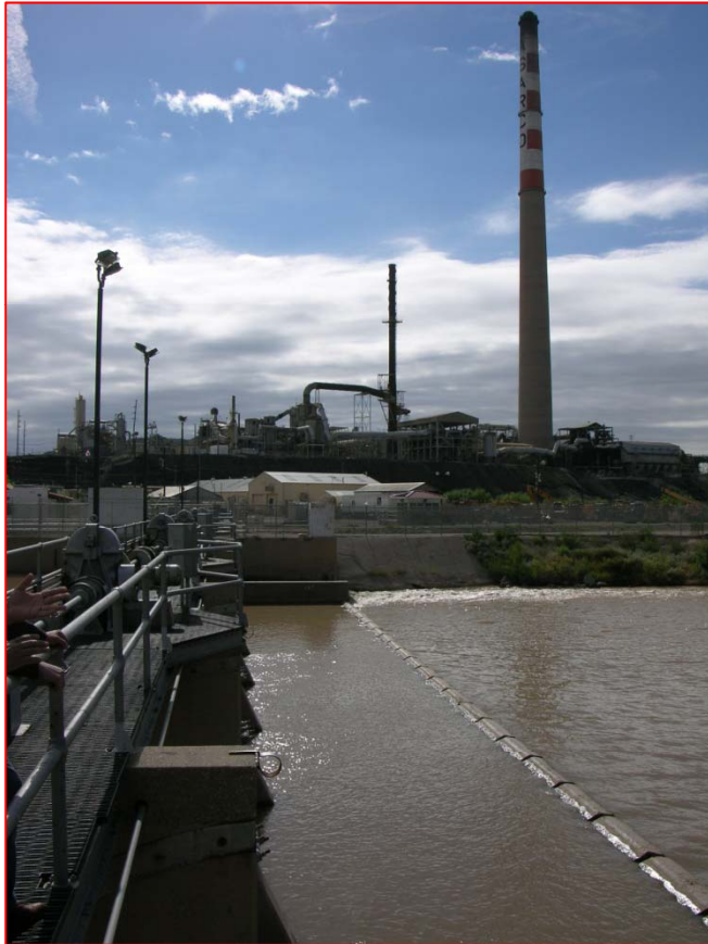
American Dam and Asarco smokestack in 2010