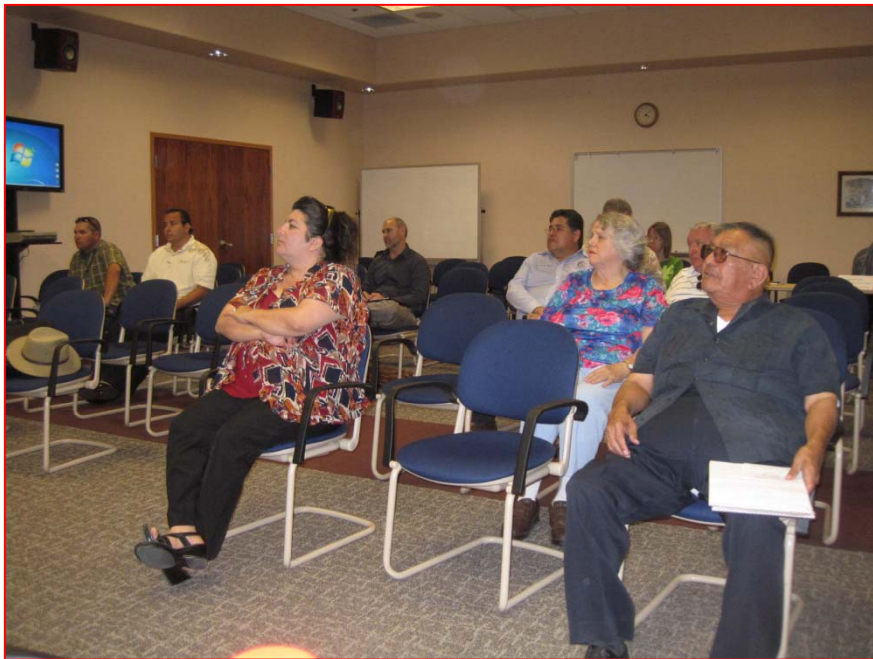
Colorado River Citizens Forum meeting in Yuma, Arizona