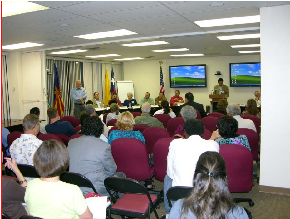
Rio Grande Citizens Forum Meeting 2011