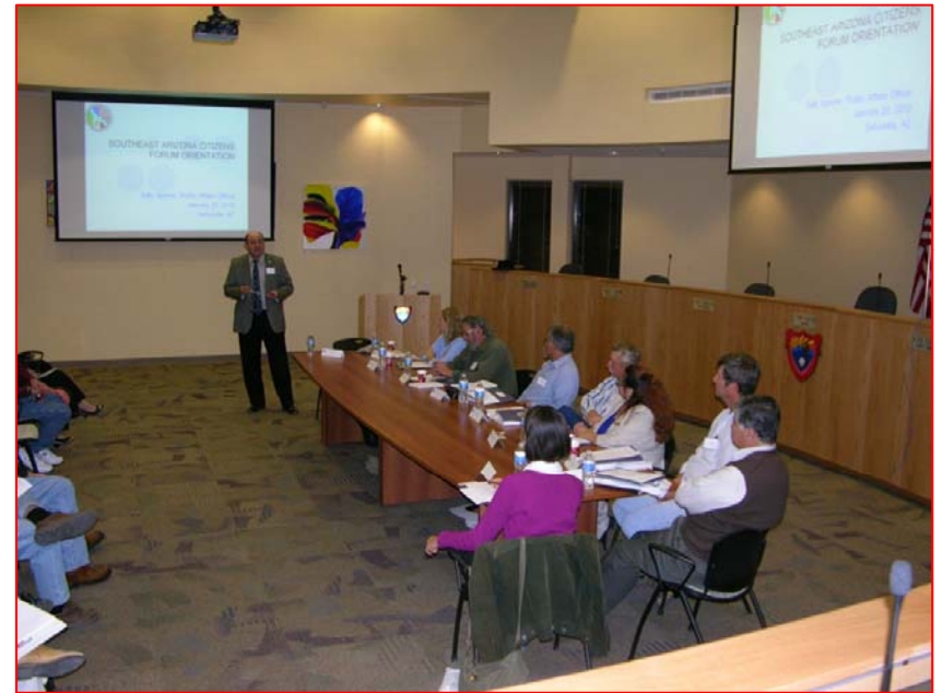
Southeast Arizona CF Board 2011-2012