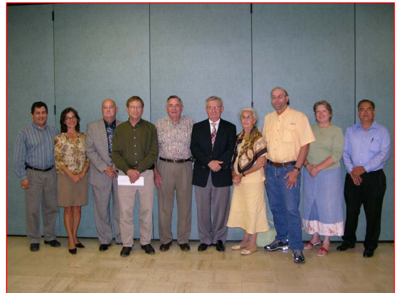
Lower Rio Grande 2005-2007 board