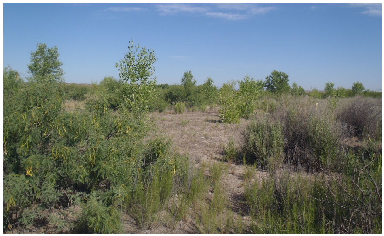
Variety of plants and shrubs around the well site. Everything around the area looks healthy considering the heat this year.