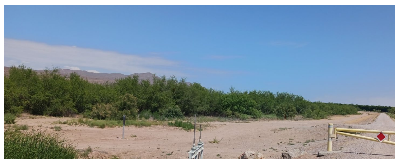
Shalem Colony site, southern end, looking upstream along the levee.

We passed by Shalem Colony Restoration Site on July 11, 2023. This is the southern end of the site near Wasteway #5. Some saltcedar is resprouting and there are mature mesquites.