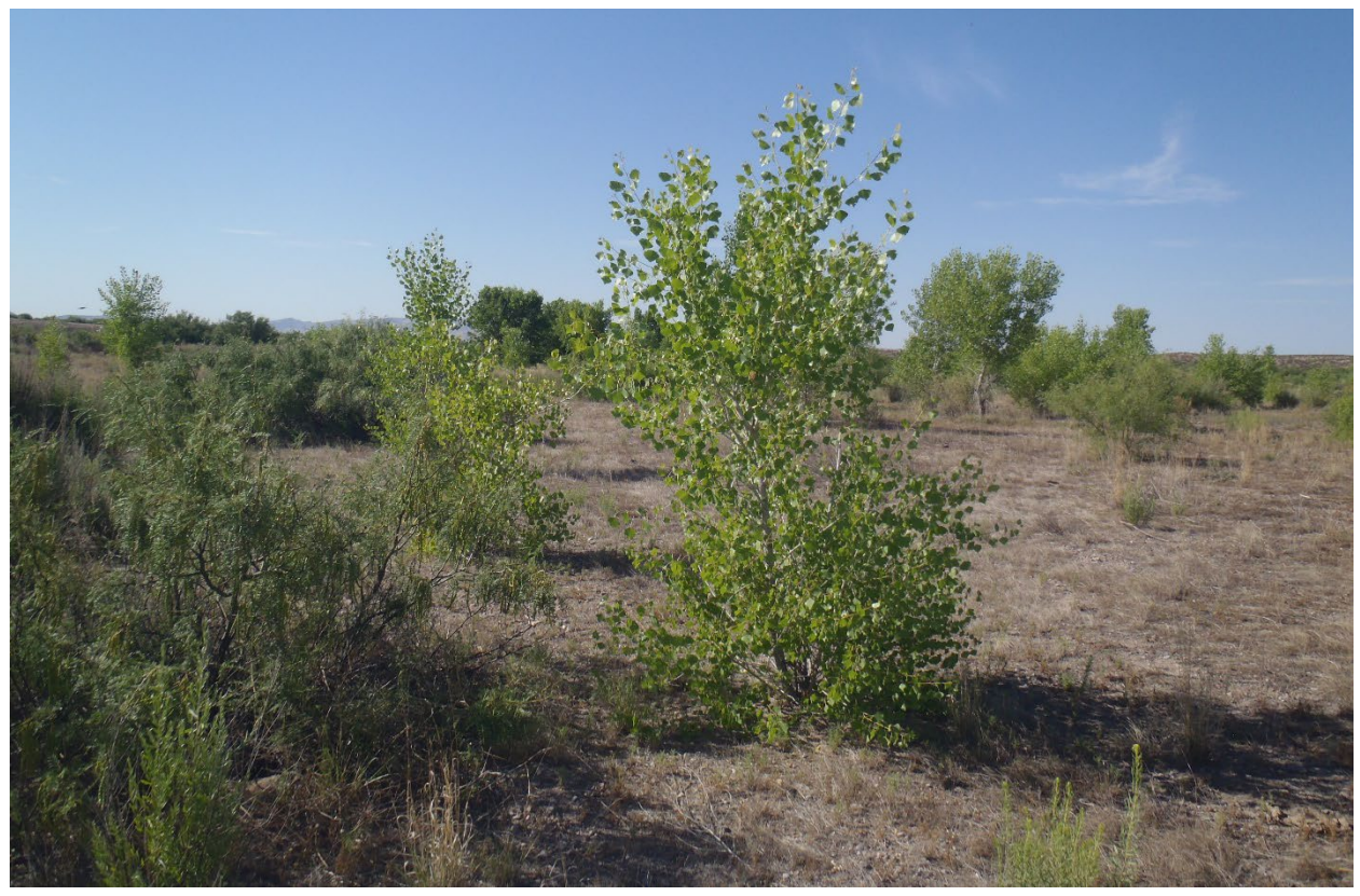
Cotton woods are thriving in Yeso East.