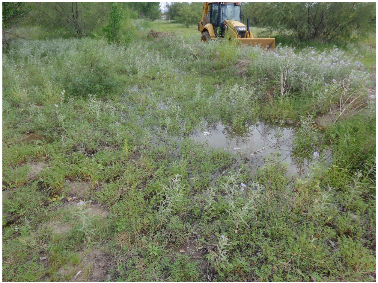
Irrigation is just started on the expanded southern side of LELWW8.