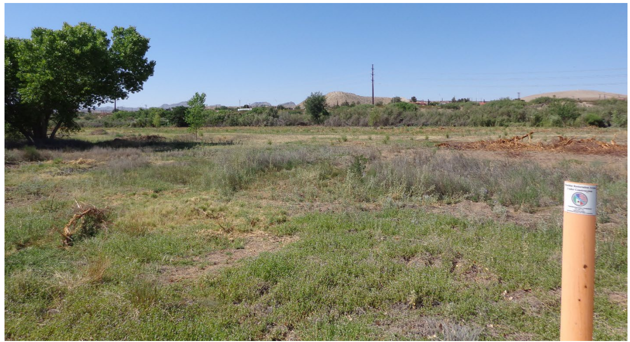
Left side of the restoration site