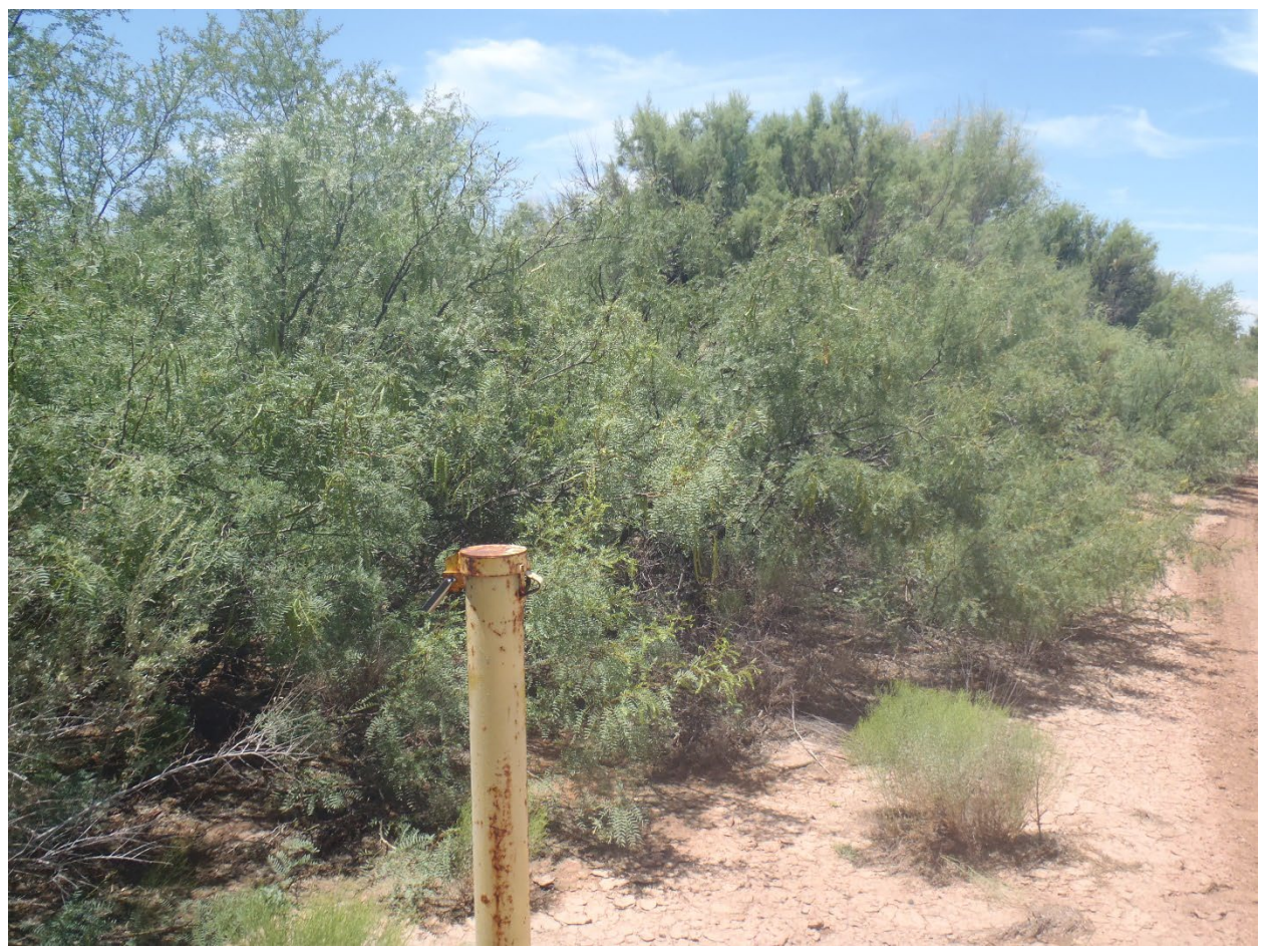
Lots of mesquite and brush but the path to the well was maintained.