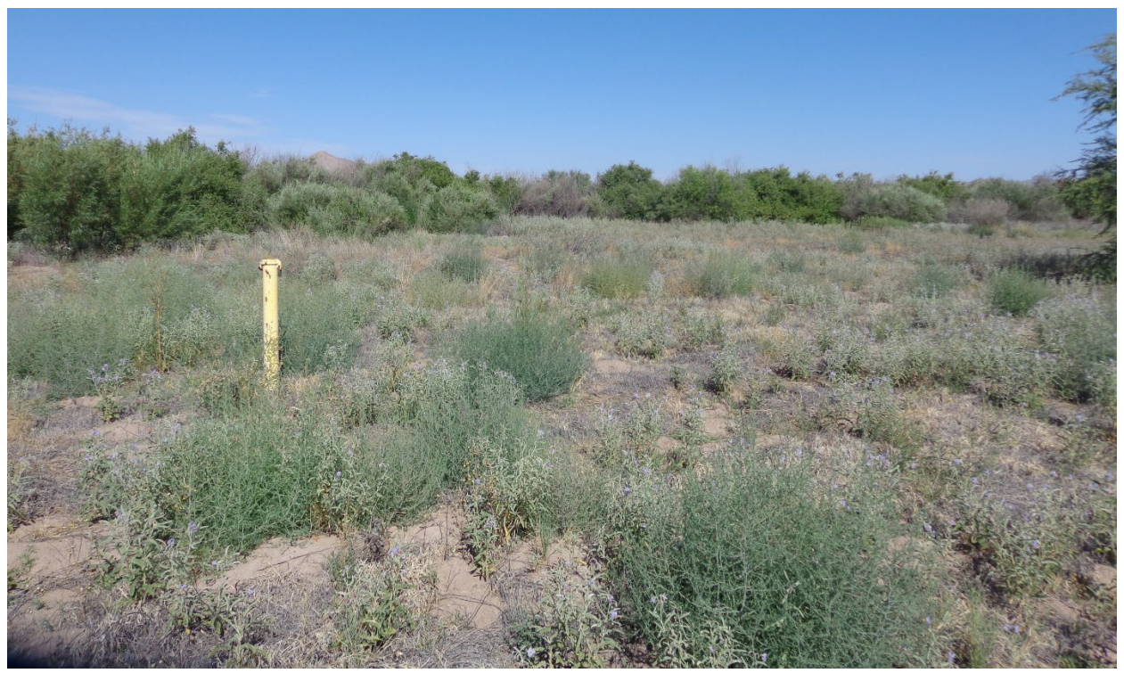
There are some willows in the distance from LEL-MW-3. This was the monitoring well that we could not measure. We then decided to come back at a later date to see if we could break open the lock or force it open.