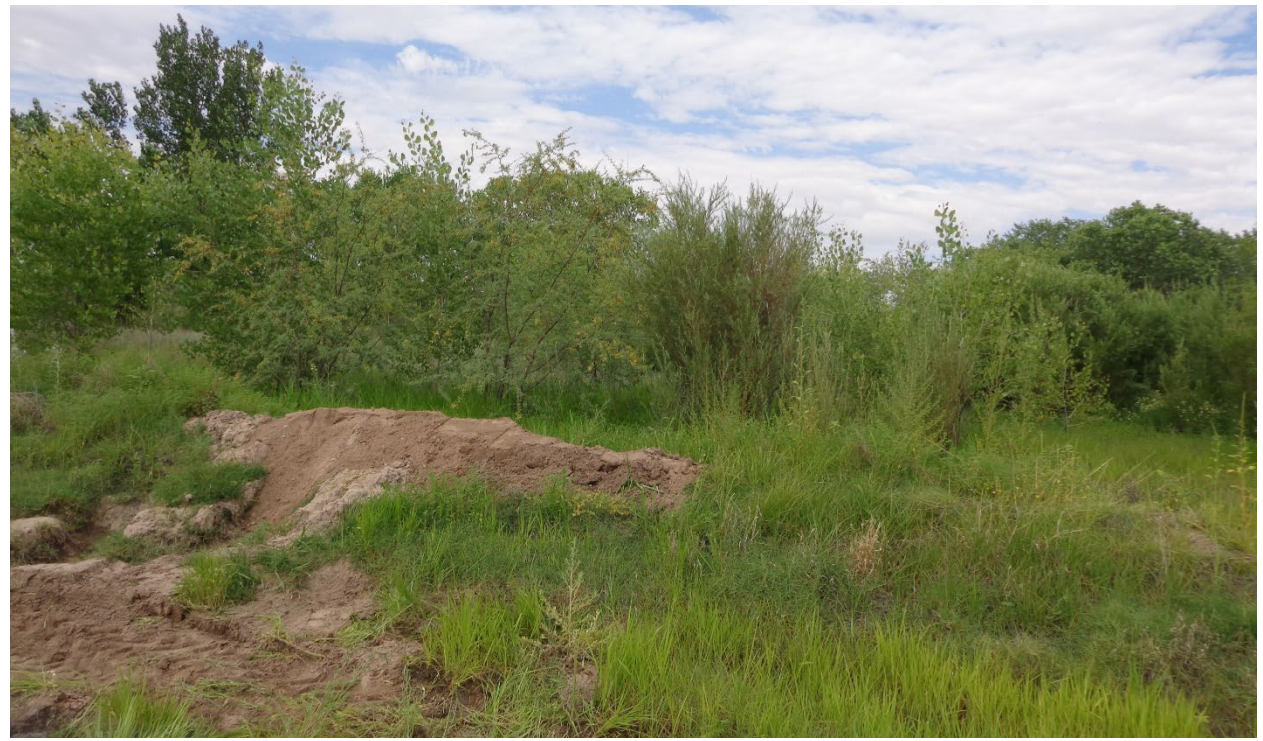
Lots of greenery in the site before the irrigation continues to flow.