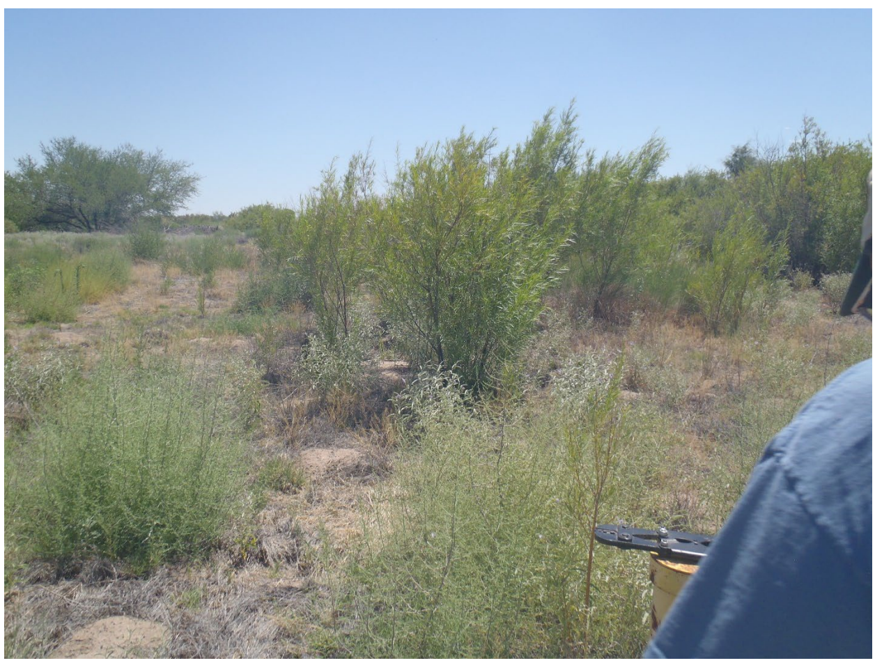
Shrubs close to the well and willows nearby, healthy and alive.