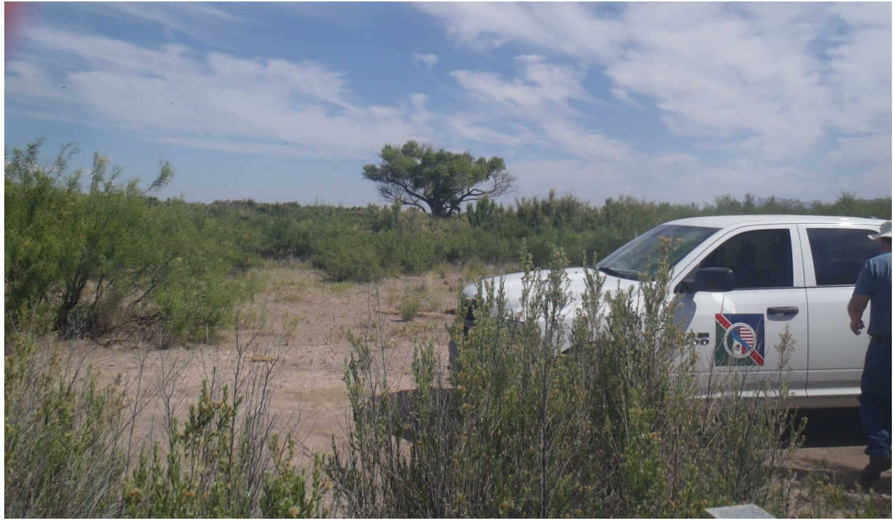
A struggling cottonwood tree in the distance.