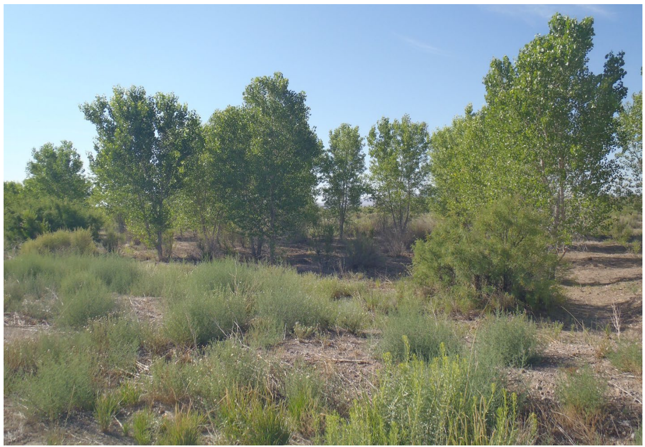
This area has nice flourishing vegetation of cottonwoods and arrow weed and other brush and grasses. The cottonwood survival in Yeso East is very high, around 80%.