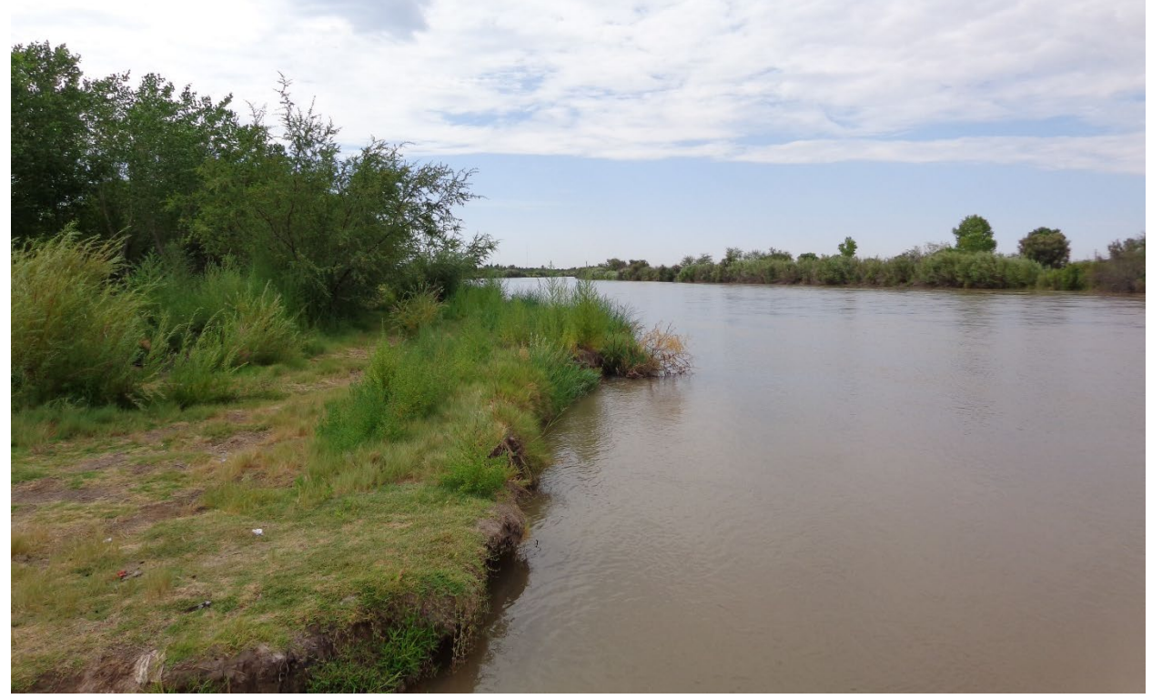
A picture by the river showing the riverside of the restoration site.