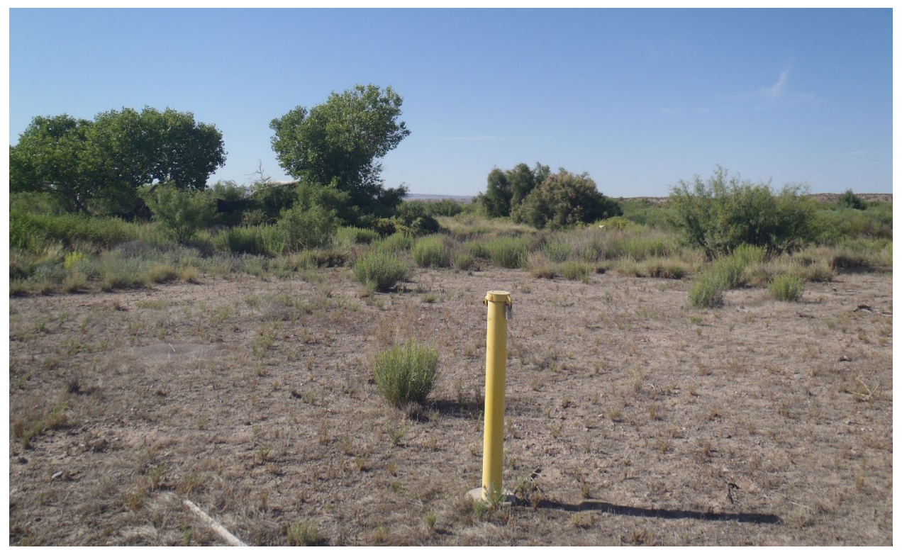
Big cottonwoods in the back of one of the Yeso East sites at YE-MW-2. No vegetation immediately surrounding Monitoring well #2.

A coverage of cottonwoods near the restoration site. Everything looks good hopefully these will fully grow in the next few years.