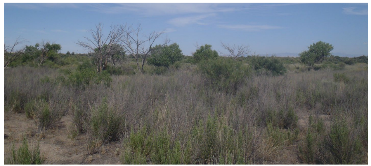
More dying cotton woods in Crow Canyon A, with mixed native and nonnative brush throughout the site.