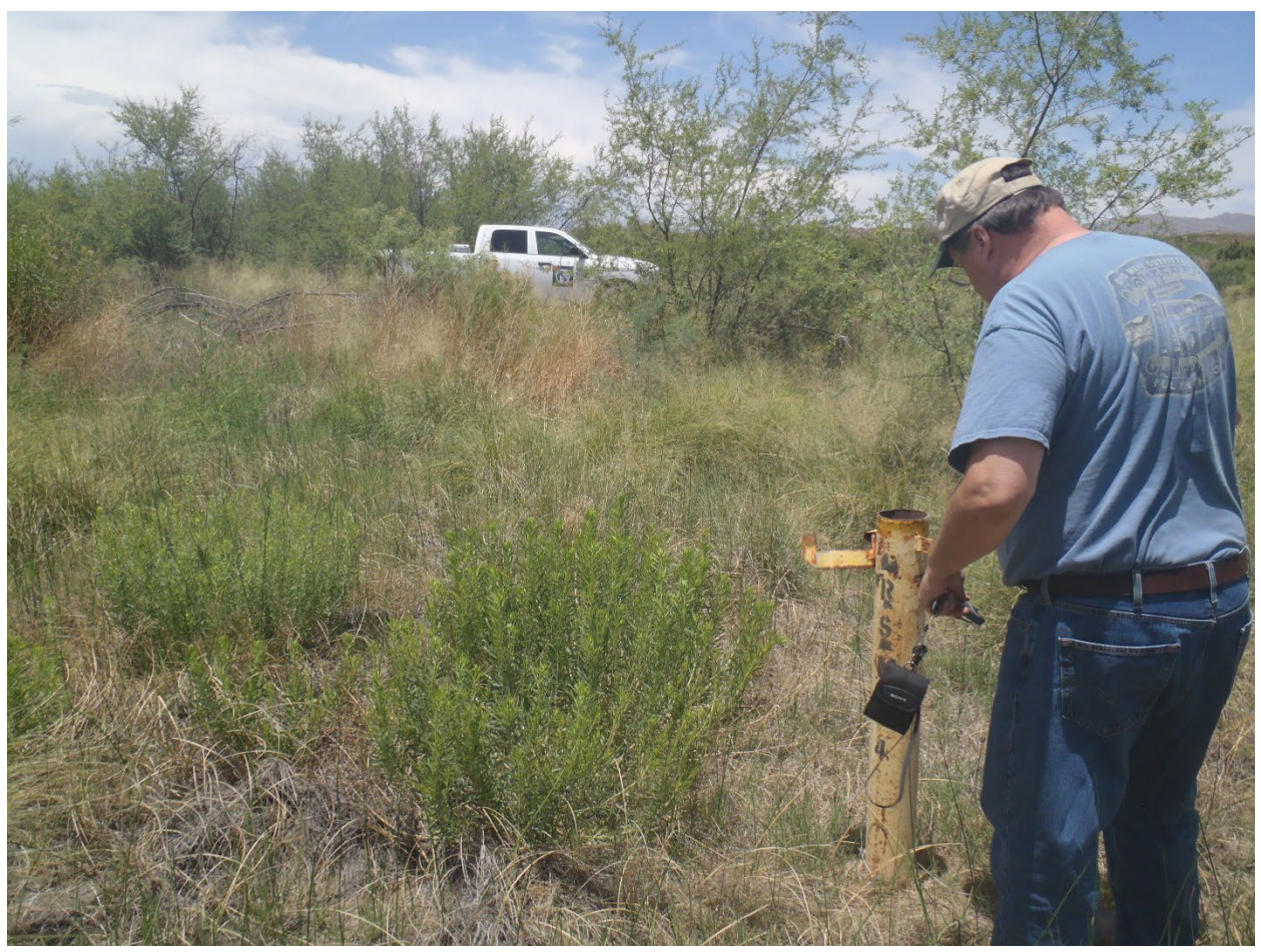
In and around the area was very thick with mud since the water table was so high.