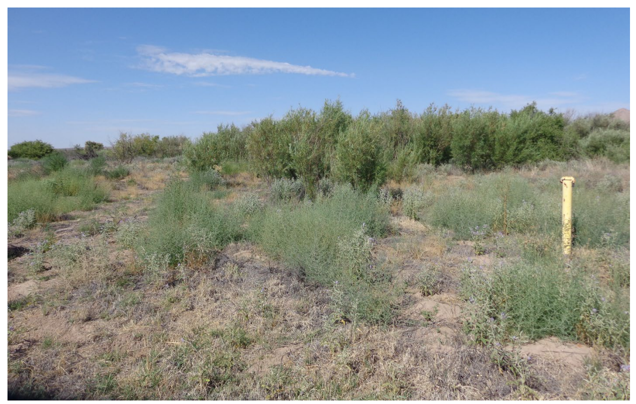
A bunch of brush near the well LEL-MW-3 with a willow stand nearby.