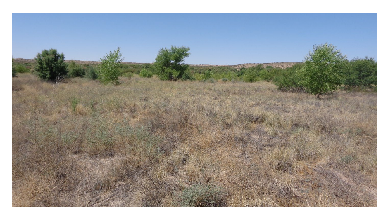
Plenty of vegetation flourishing. Lots of greenery towards the back of this image.