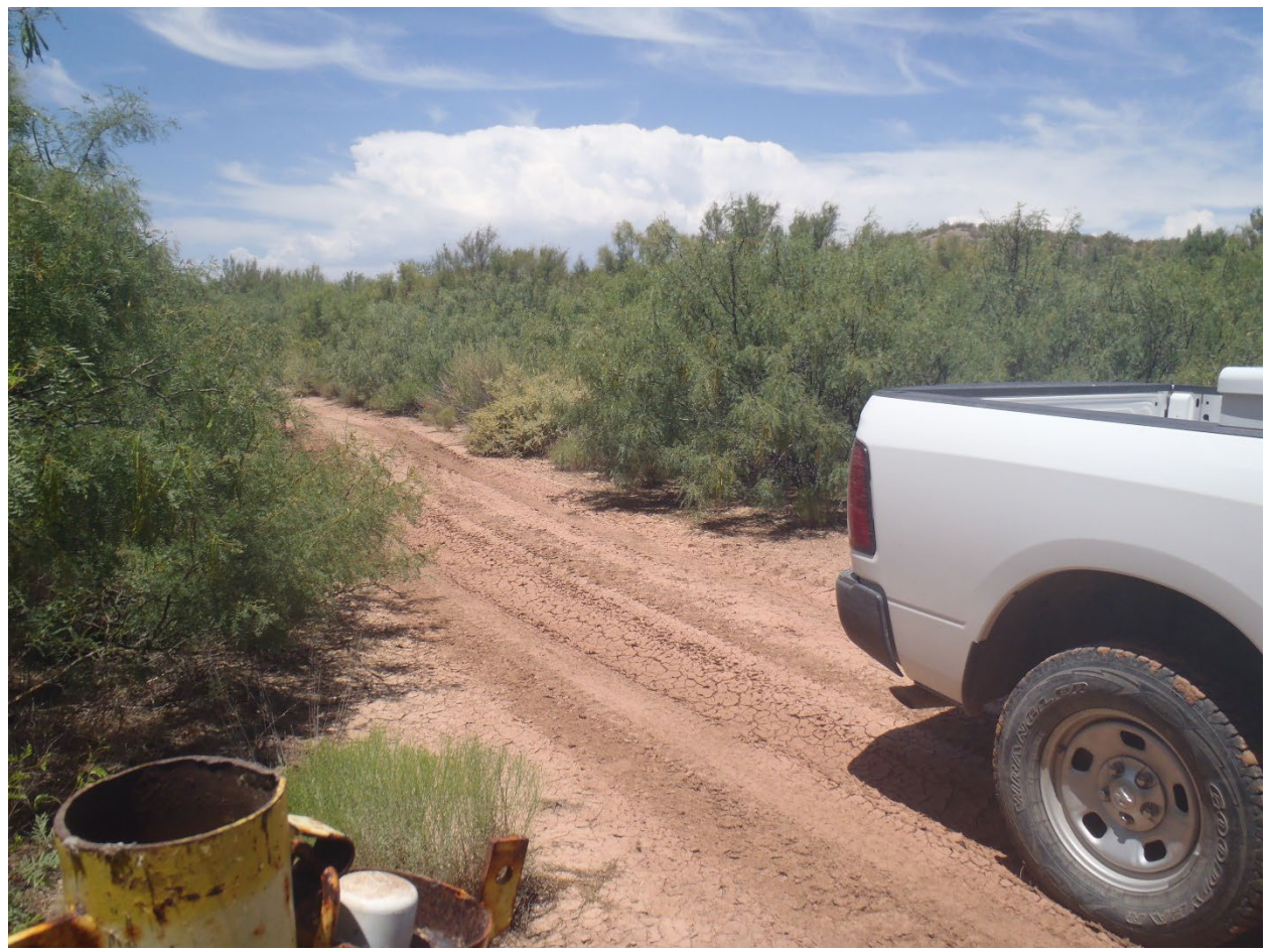
Road leading up to the monitoring well #7. Both sides are surrounded by the same type of brush (mostly mesquite).