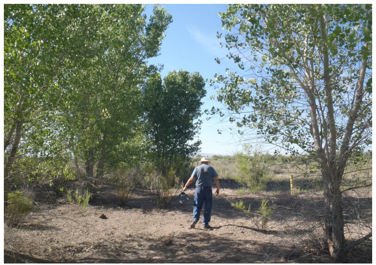
Heading towards the first monitoring well of Yeso East shaded by the cottonwoods.