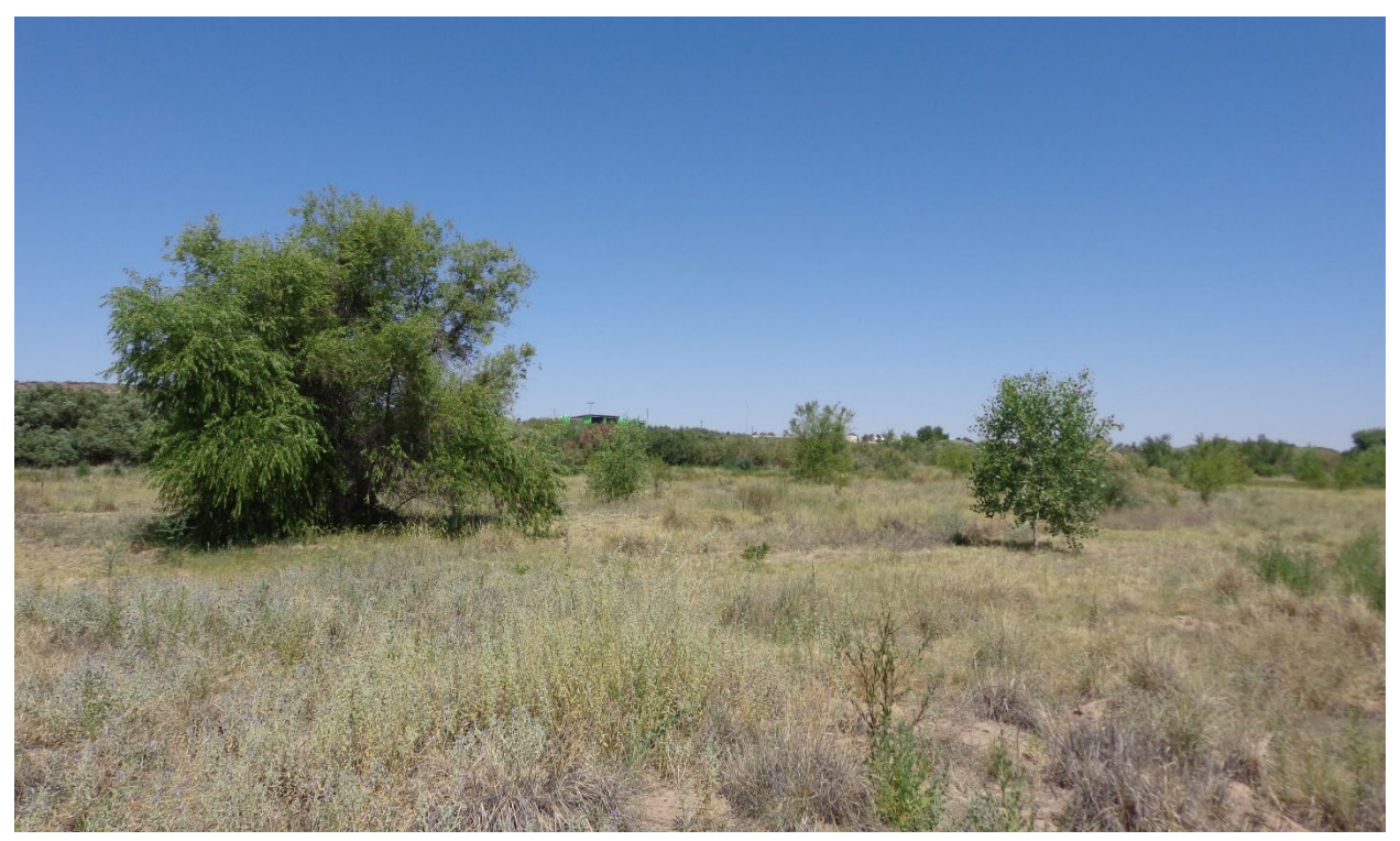
Big mesquite and some cotton woods, survival rate does not look as high, but this is looking north, and the rest of the site looks like it's in good shape.

This is further north at the Country Club East site. The floodplain widens and the more upland area near the levees has more scrub habitat. Willows are along the background by the river. The plantings appear to have a high survival rate. No observable wildlife species in this area of the restoration site.