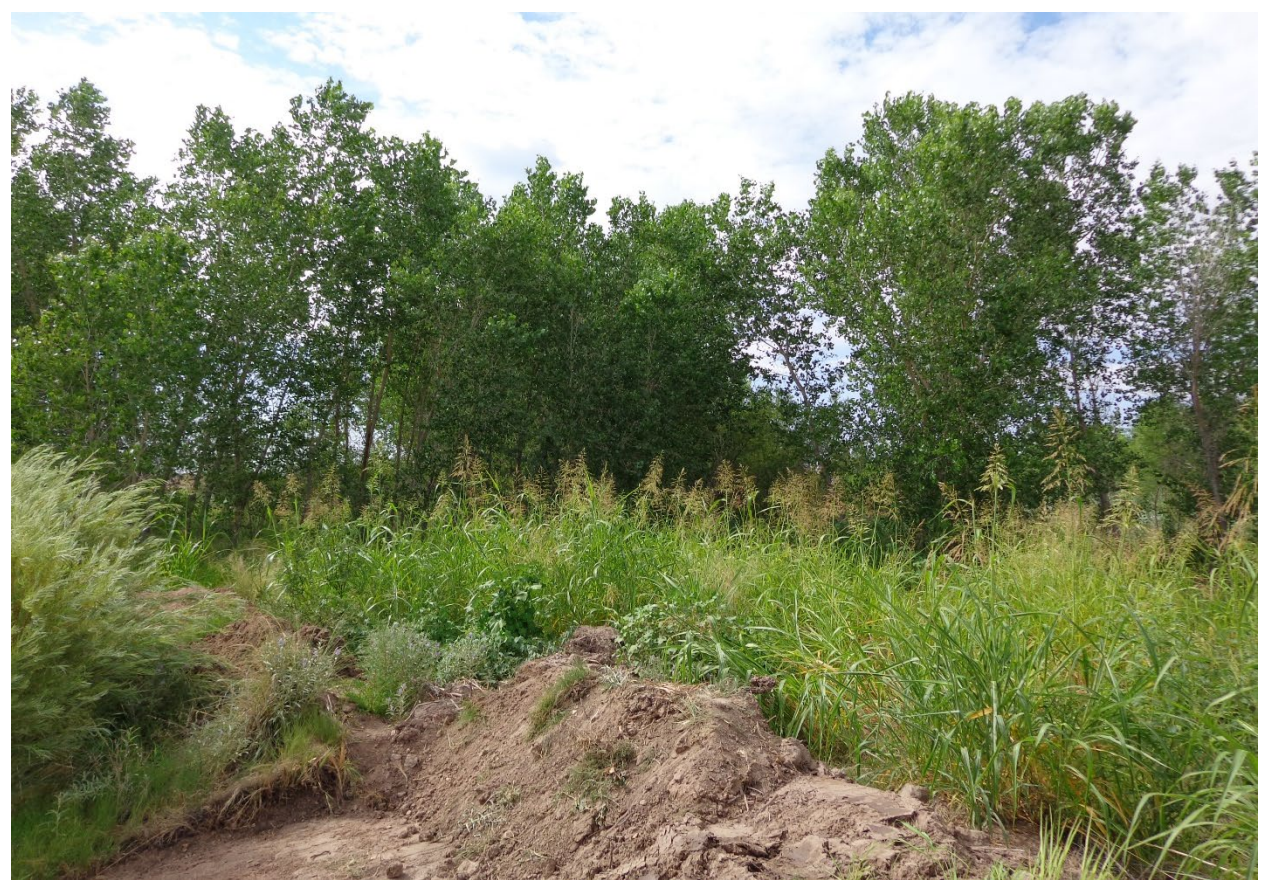
Tall cottonwoods shade the entire area as well as some brush.