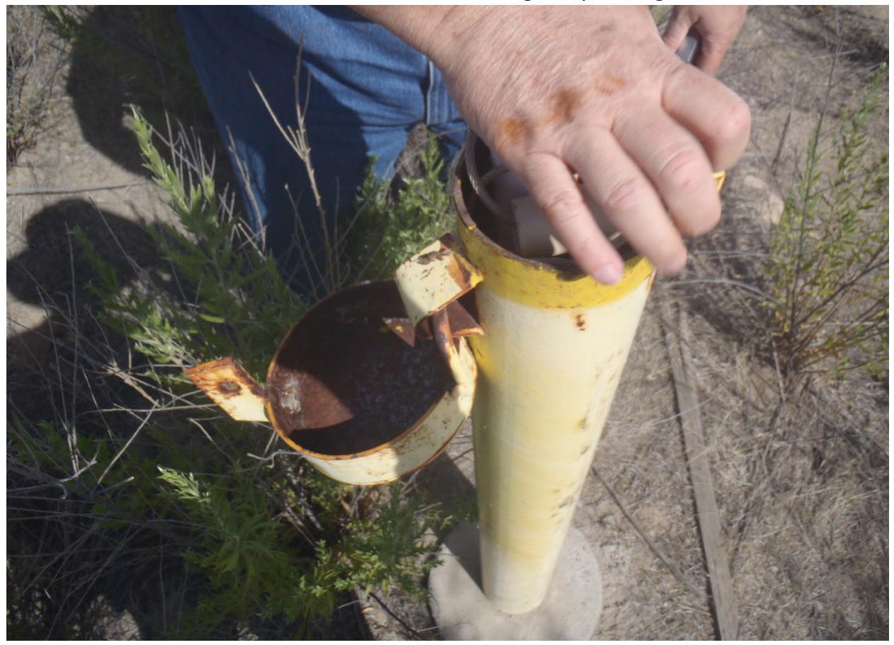
Struggling to pull the sonde out. We decided to leave it and move on to the next well.

This was the well CCA-MW-1 that had the additional sonde. Unfortunately, it was not retrievable, and the well was obstructed so we couldn't get any reading on it.