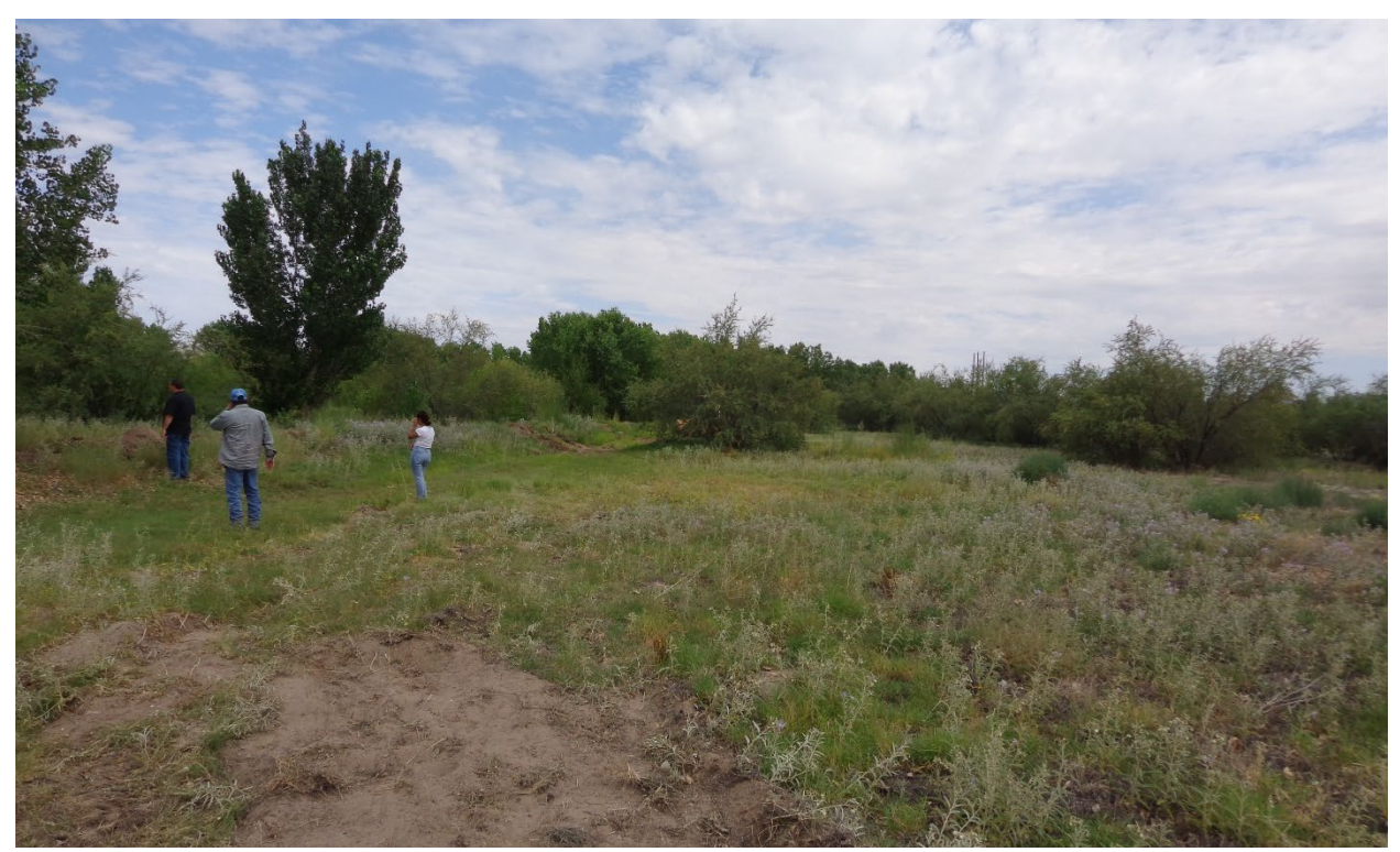
There is a lot of land in this photo but the whole site looks very healthy and green.

Family of cute skunks hiding under a cottonwood that evacuated their habitat due to the irrigation.