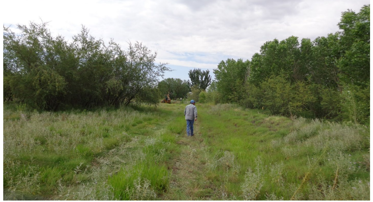
The path that the machinery made so it was easier to access the areas. There is machinery just straight ahead of David. Lots of greenery this is a good sign.

Following David, we can see more thriving vegetation and everything in this area looks really good and green. Survivability of this area is very high, and I estimate that it is above 80%.