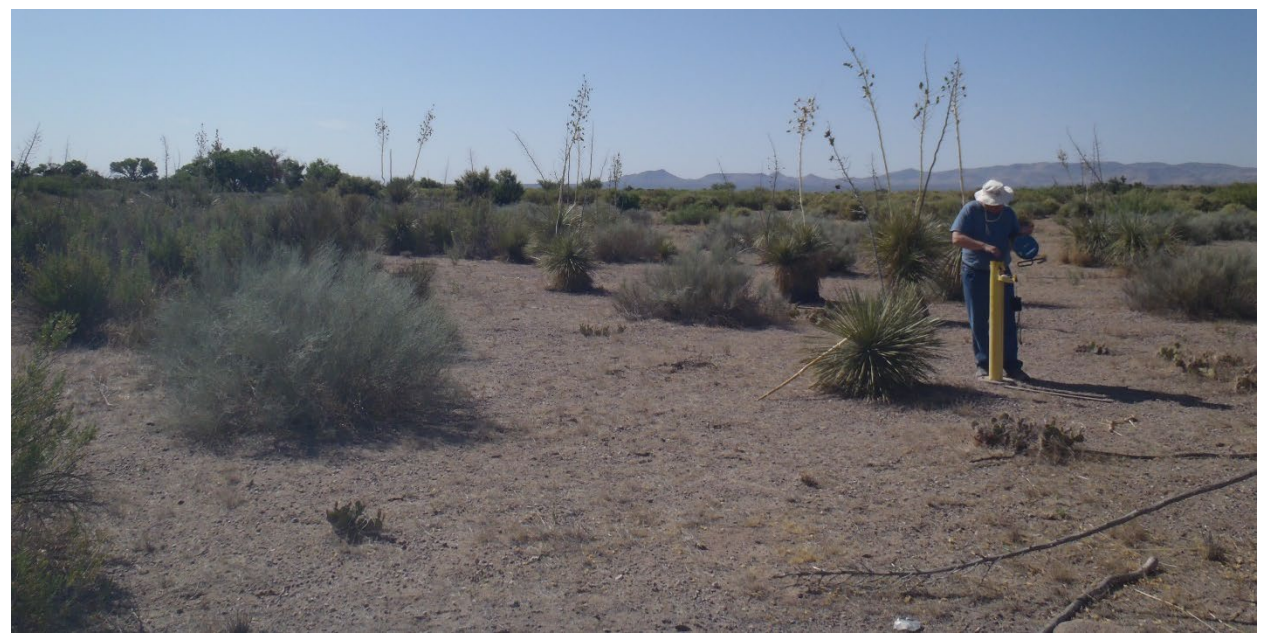
A better view from the well you can see an abundance of upland vegetation in the back.