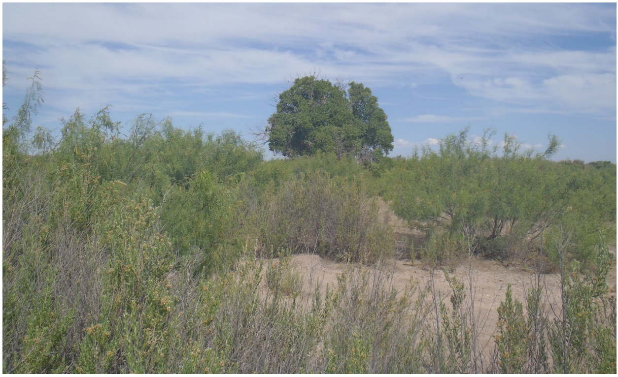
Big cotton wood near the well site. This one seems to be doing a lot better than the others.