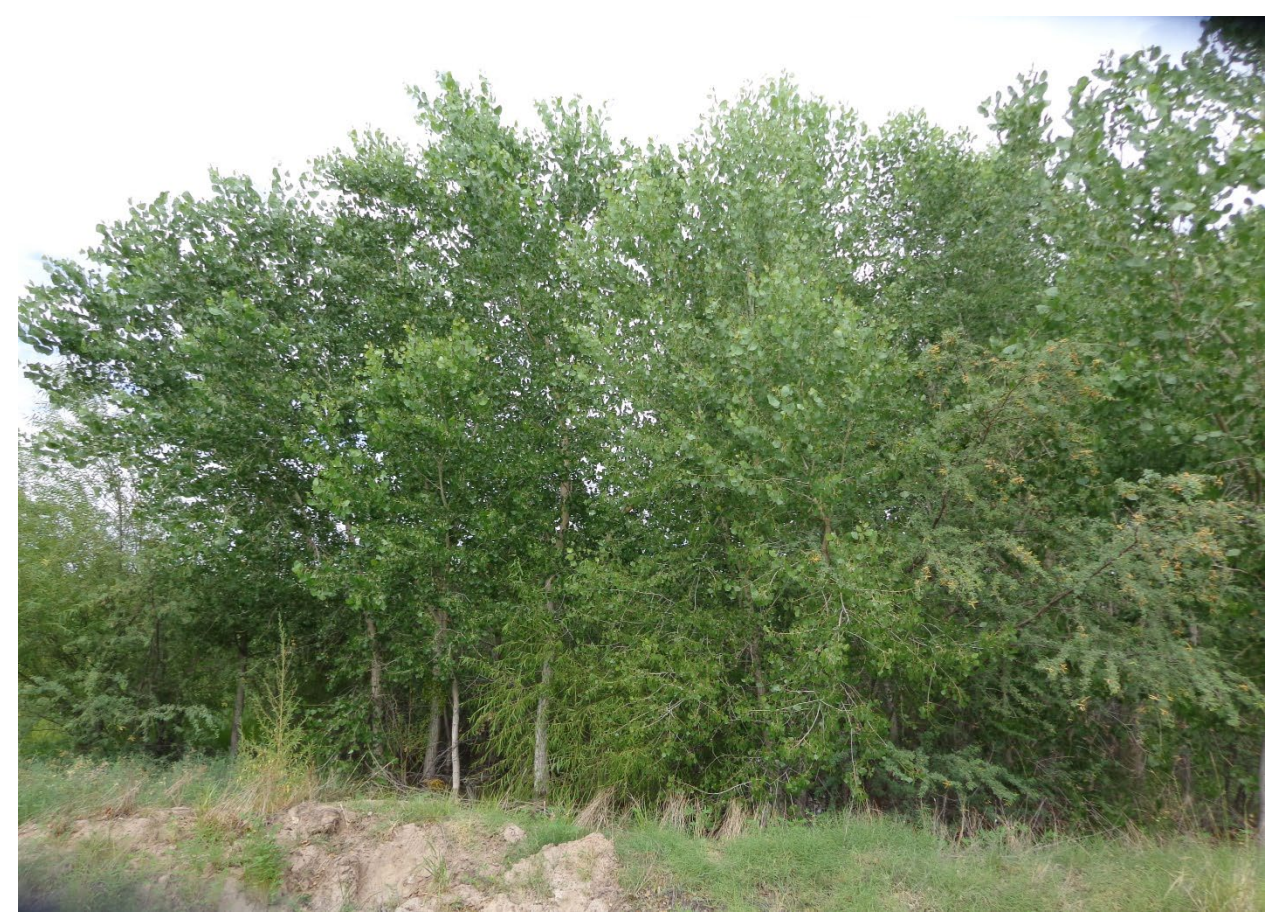
Tall cotton woods enjoying the irrigation.