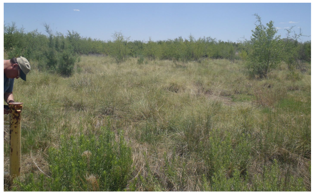
Here is a different angle of the well along with some additional vegetation.