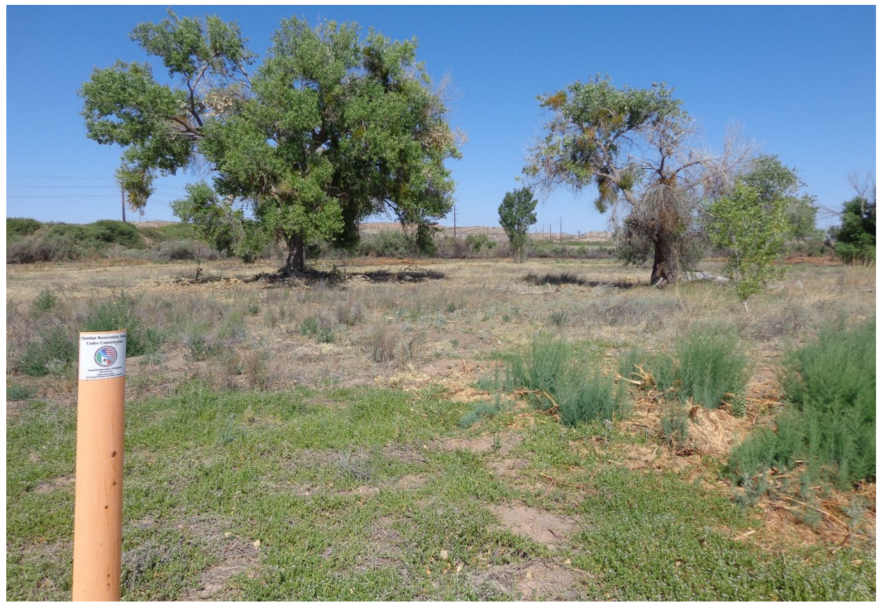
Right side of the restoration site. The trees seem to be decaying or dying off due to mistletoe or some fungal infection. No notable wildlife species in the area.