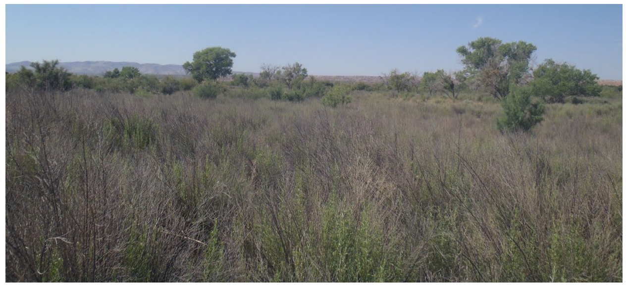
We can also observe the same pattern of dying plants on the left as well.