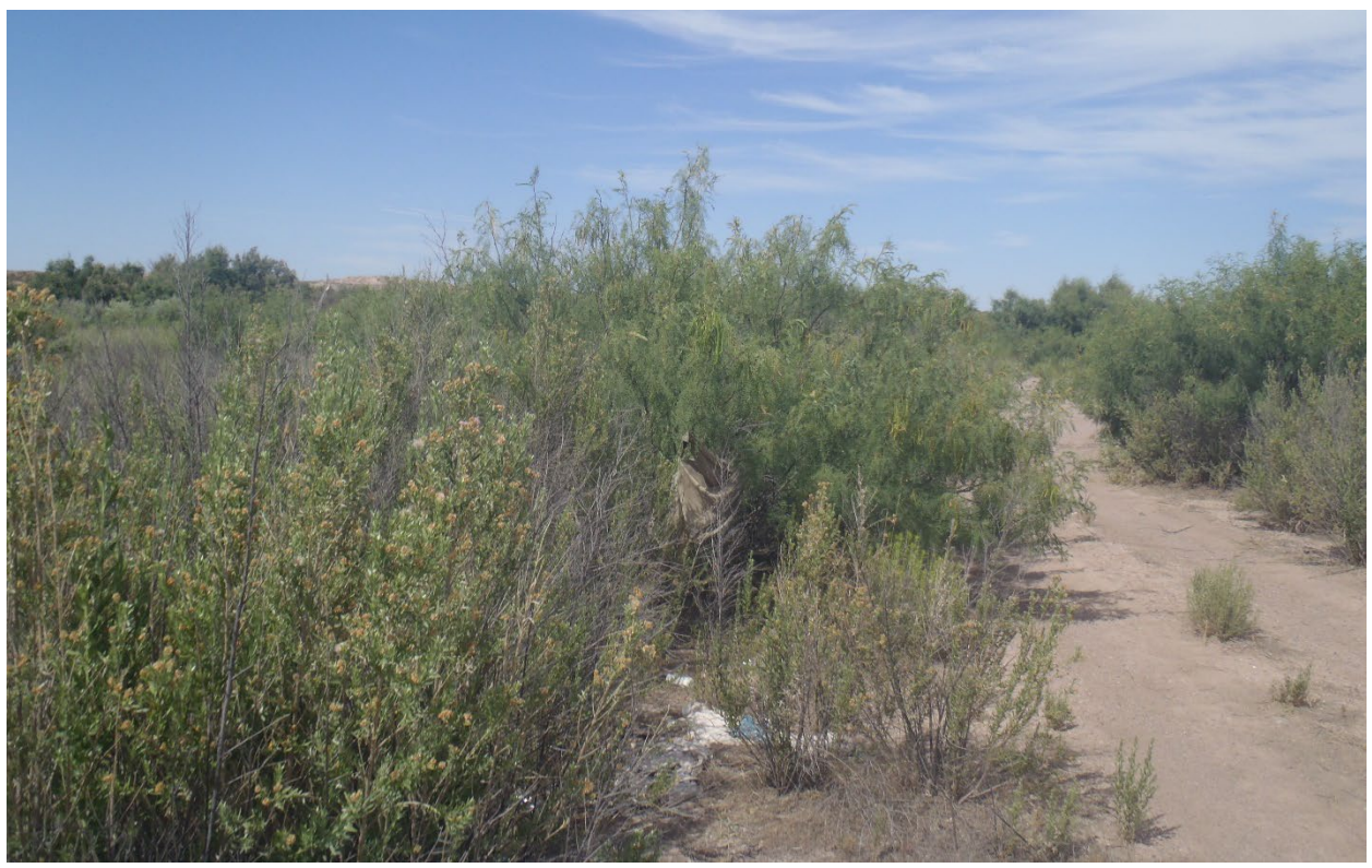
Road with some trash near the bushes. Some trash is visible.