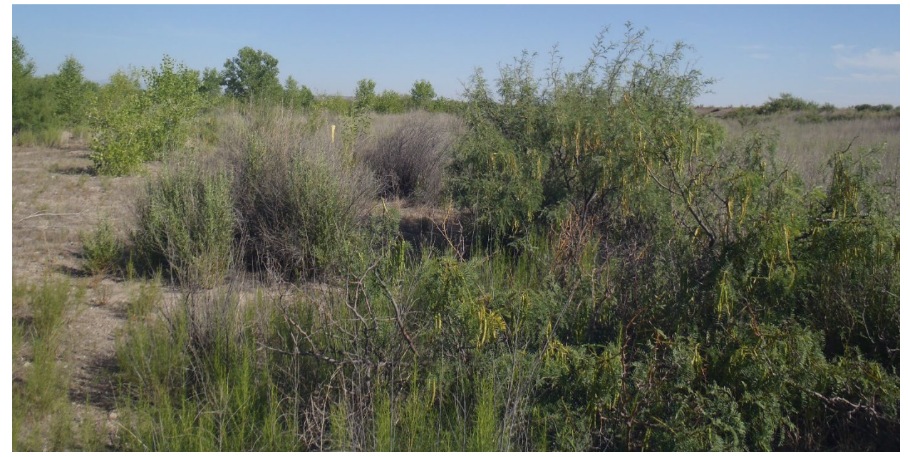
View of YE-MW-3 looking southwest with some cotton woods in the back and mesquite.

Horny lizard on the way to the next monitoring well enjoying the hot weather. Hard to see in the very similar sandy background.