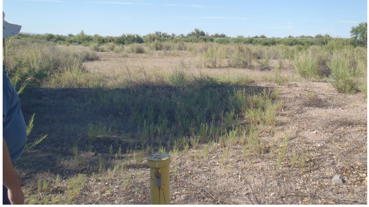
YE-MW-1 view looking towards the south, good vegetation near the riverbank, but scarce in the floodplain outside of the irrigated area of the old river meander.