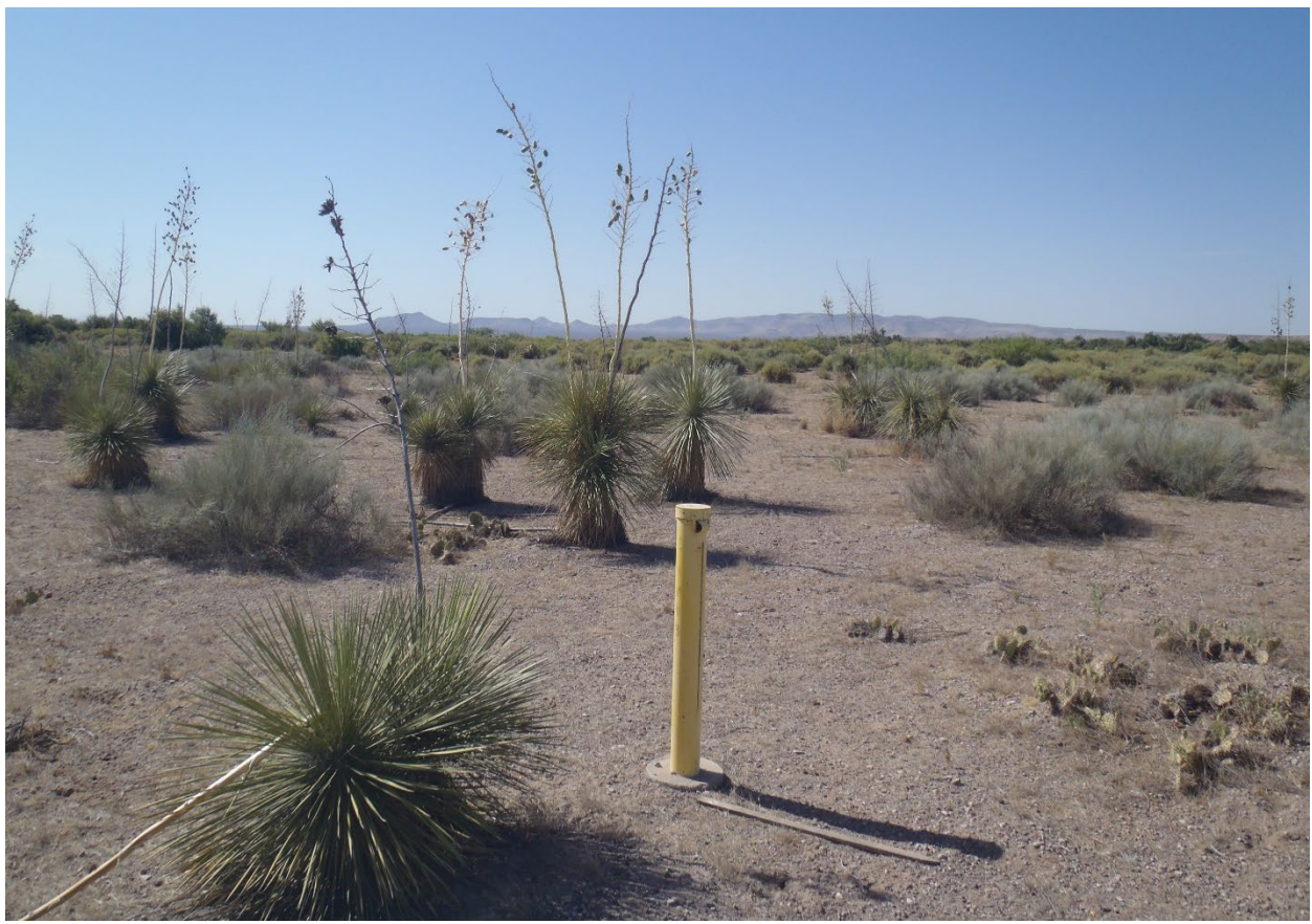
We visited in Crow Canyon well CCA-MW-3 around 9:55 and we finished around 10:55 for the Crow Canyon restoration site. Well #3 is upland and is surrounded by flowering yucca.