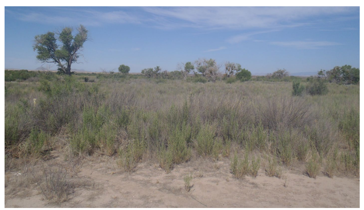
A better picture of the ailing cottonwoods.

Well #2 was surrounded by tall brush barely visible from the picture. In the back you can see a dying cottonwood and on the right of this pictures you can see more dying old cottonwood trees.