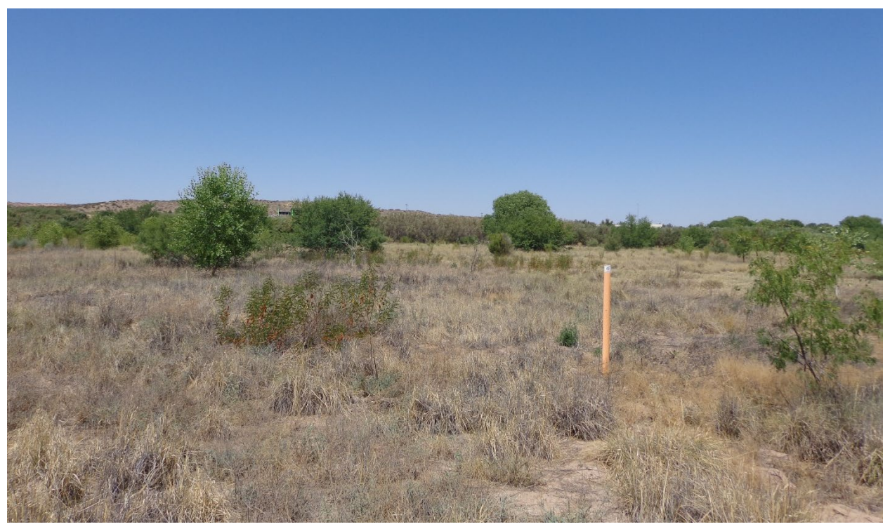
Here are some additional photos taken close to a restoration site marker. Good quality of plantings in the distance.