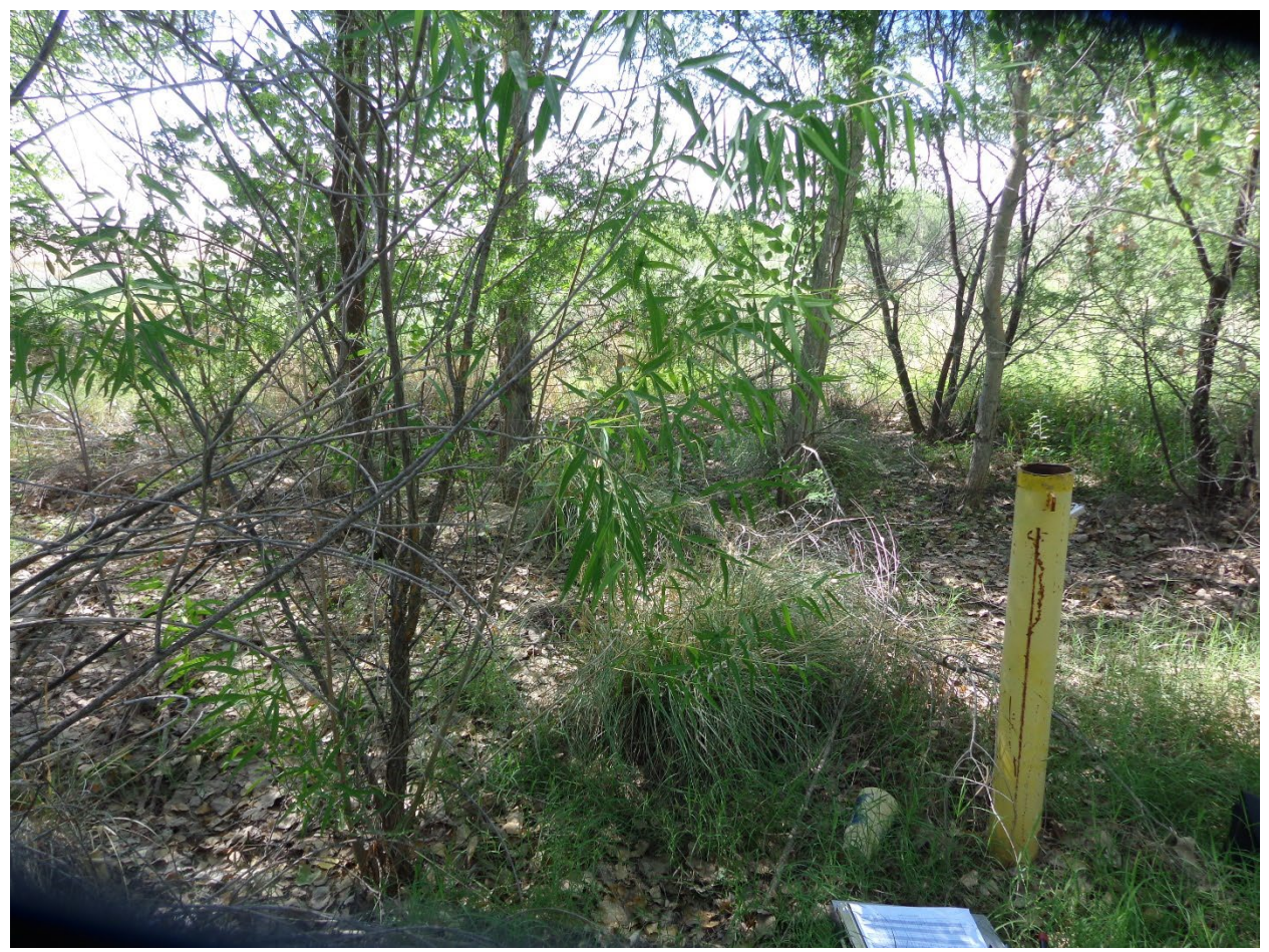
Picture of the irrigated area at well LEL-MW-2. Lots of vegetation including this large Gooding's willow, and it was hard to get to because of the overgrowth of the area.