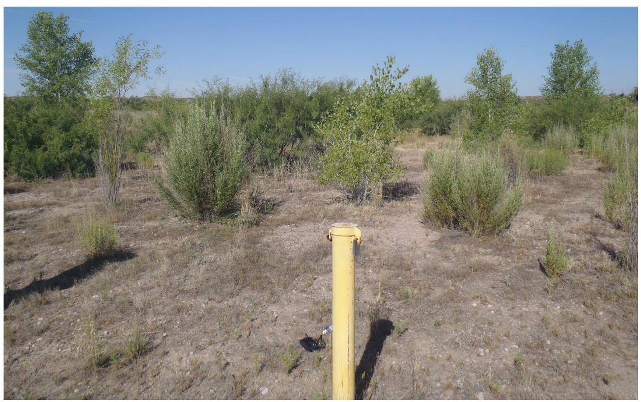
Vegetation along the well site YE-MW-3. The well was surrounded by vegetation so it was hard to locate but once we got there the area around it was easy to access.