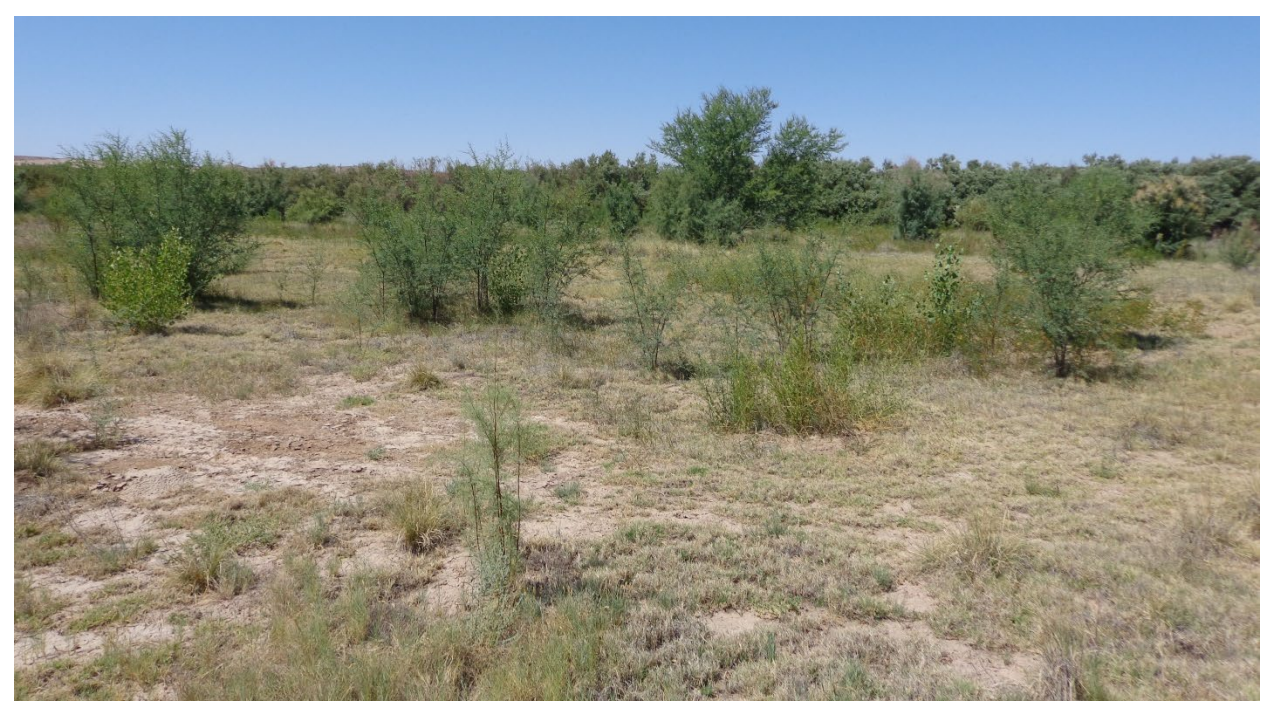
Good vegetation here, including cottonwood plantings, some mesquite, some salt cedar resprouts, and some brush here and there.