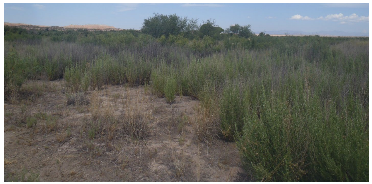
This was to the right of the well site.