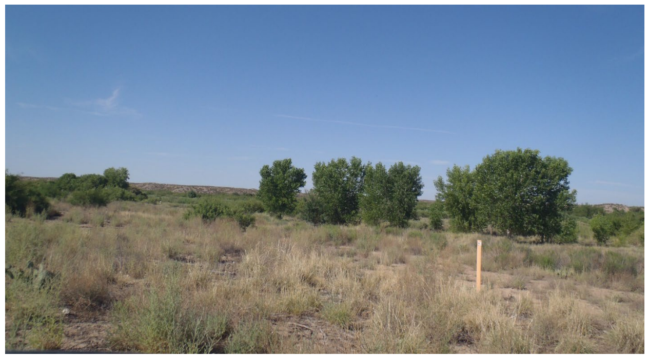
On our way to the last well. These are the Cottonwoods in the area.