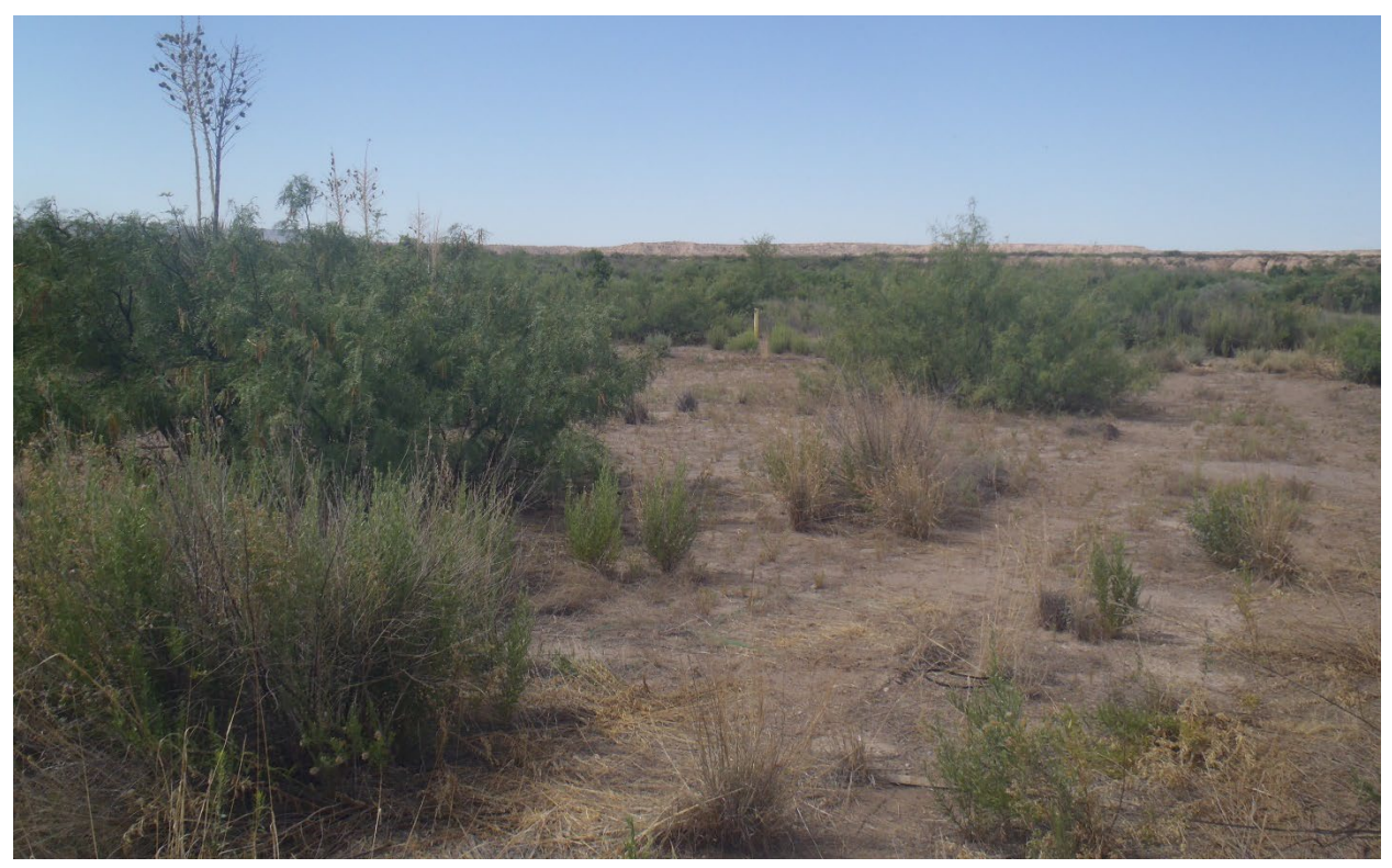
This was the first monitoring well of Crow Canyon B #1 and as you can see there is a lot more other vegetation such as mesquite surrounding the well. Around this time, it was 10:35.