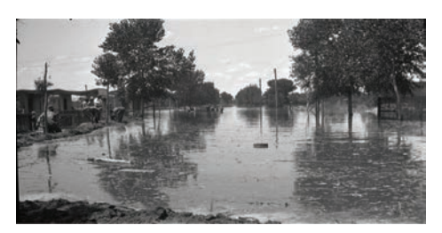
FIGURE 2: FLOODING FROM THE RIO GRANDE AFFECTING ADOBE HOUSES. PEOPLE HAVE INSTALLED EARTHEN FLOOD MEASURES TO SAVE THEIR HOUSES.

protection to the valley lands is strongly demonstrated. The international features of a complete river rectification plan greatly complicate the formulation and accomplishment of a definite program. Officials of the City and County and the El Paso Irrigation District are taking steps to construct protective works by a county bond issue, providing for the building of a river road on an embankment wholly within the territory of the United States. In this program the Bureau of Reclamation will probably be called upon for the use of equipment now on the project. A survey is now being made of the necessary reconstruction of project canal and drainage features damaged by the overflow (Brown, 1925, p. 9).