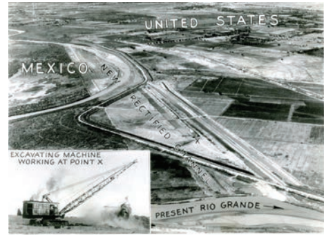
FIGURE 5: RECTIFICATION PROJECT, COURTESY USIBWC ARCHIVES.

All the New Deal projects in the El Paso - Ciudad Juarez borderlands can be seen today and are still in operation, more than 80 years since constructed. Although there have been repairs and modifications, the Rectification Project has remained as is since construction, except for areas south of Fort Hancock that have silted in and raised the river floodplain. Work by the USIBWC over the years has dredged much of this to bring the river back to flowing and decreased elevated water levels in the area. But what about the history of some of the locations that traded land for Rectification to be successful? Archeologically speaking, many sites of former homes, land and structures are still there.