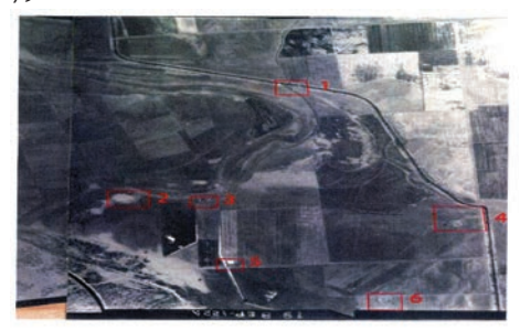
FIGURE 7: AREA OF STUDY SHOWING THE RIO GRANDE IN 1928, NUMBERS REPRESENT HOUSES, STRUCTURES, ETC., IN BOTH THE U.S. AND MEXICO.

In 2018, locations were checked for sediment disposal locations of the USIBWC on El Paso Water Utilities lands west of Fabens, Texas. In these locations and comparison to the USIBWC 1928 Aerial photos, it was seen, and field verified that many former homesteads are still there. These are now archeological sites. These were houses, farms and homesteads of people on both sides of the Rio Grande before the Rectification Project (Figure 7) .