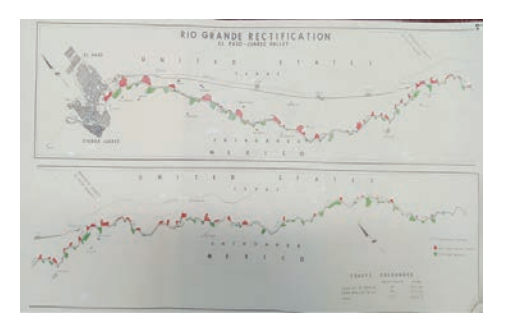
FIGURE 6: RECTIFICATION MAP SHOWING CHANGES IN LAND ON BOTH SIDES OF THE BORDER.

In a speech at the San Elizario Genealogy and Historical Society annual conference on April 27, 2024 (Howe, 2024). I was able to show how the Rectification Project not only changed the border but helped to curtail flooding in the area, especially after the decimation by the 1925 flood. But, in combination with how Archeological work completed in the past few years was able to show the borderlands before Rectification and the remnants of changes under the various IBC Minutes had on the borderlands.